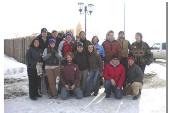
Members of the MT Energy Corps, MT Conservation Corps and MT Campus Corps with Opportunity Link staff at Fort Belknap celebrate the National Day of Service

NCMT buses provided rides to volunteers throughout the day as they celebrated and promoted their first ever use of biodiesel in their buses.