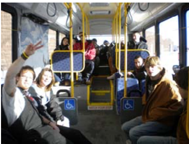
Most YouthBuild participants are regular passengers of North Central Montana Transit and Rocky Boy Transit. They are shown here on board NCMT’s Red Line bus.