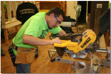
A youthbuild participant building part of a park bench in MSU Northern’s carpentry lab