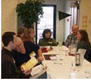
Attendees at the 2008 Annual Membership meeting on January 19 at the Holiday Inn Great Falls.

Opportunity Link is committed to finding systemic ways to reduce poverty and help the communities of Northcentral Montana achieve independence, prosperity and a better way of life.